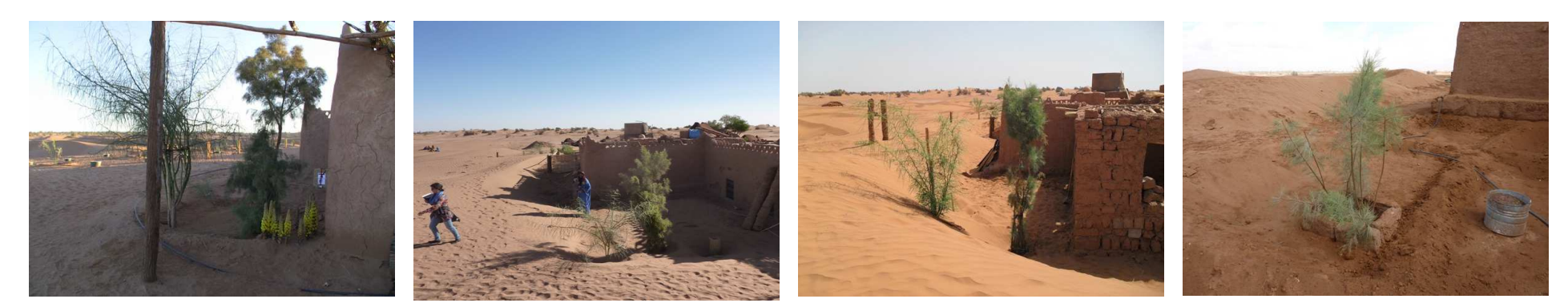
October 2011 Tamarisk 1 year