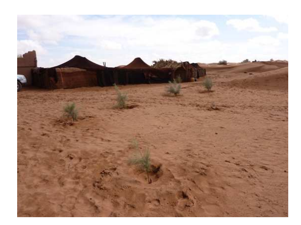
October 2011 Our first trees after 1 year in the Groasis waterboxx