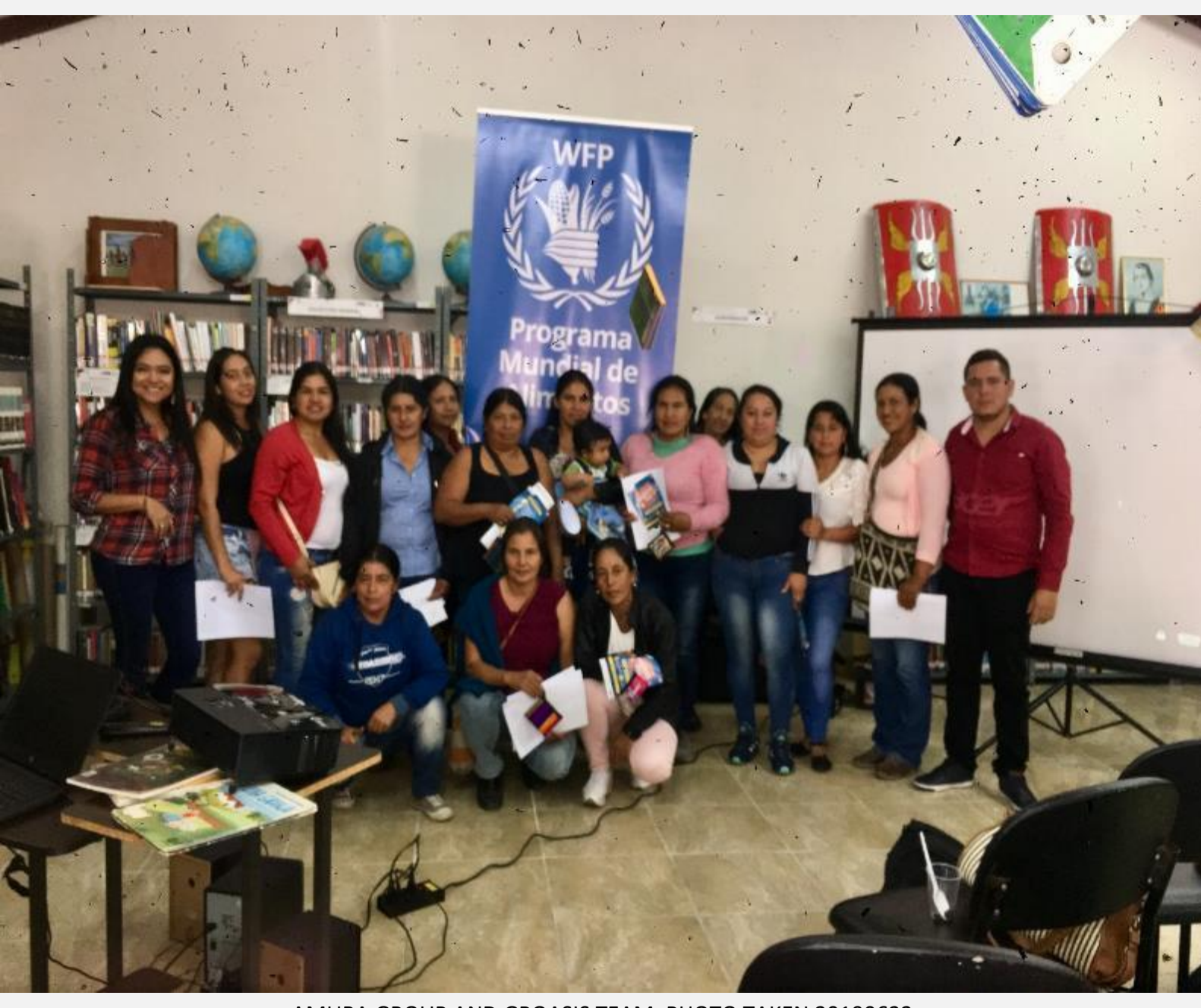
AMURA GROUP AND GROASIS TEAM. PHOTO TAKEN 20190622