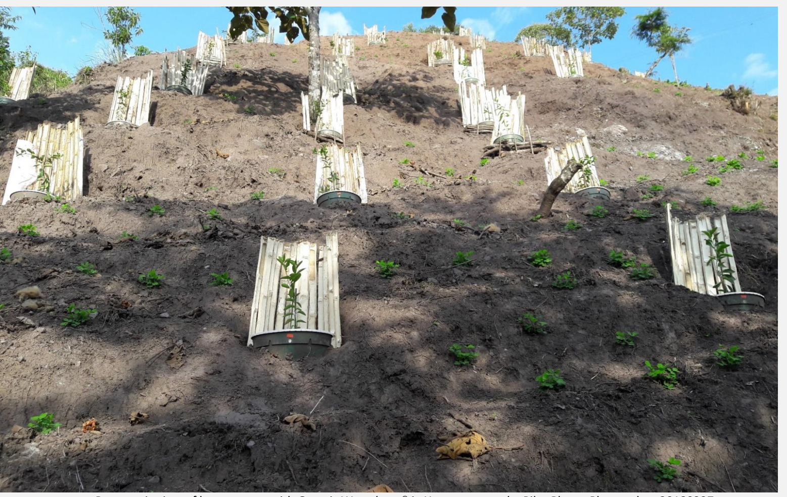
Panoramic view of lemon crops with Groasis Waterboxx® in Yacuanas vereda. Pilot Phase. Photo taken 20180327.