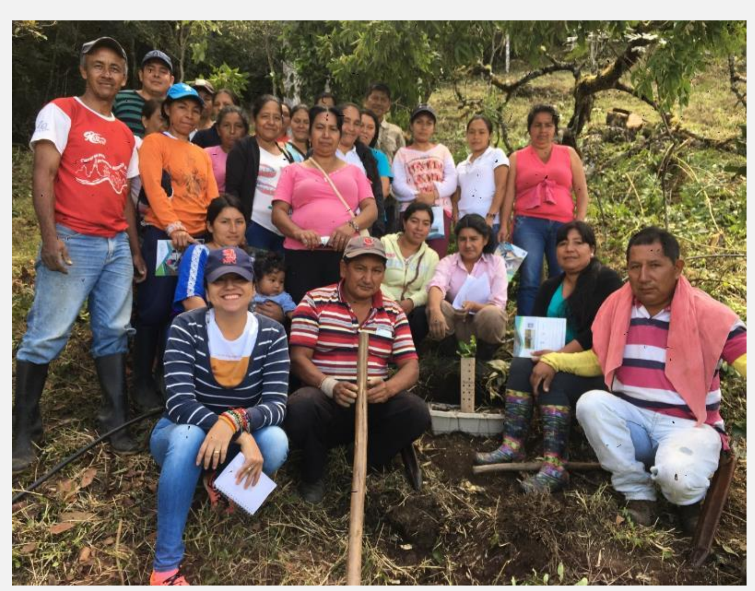
Achiral Group in the implementation of Phase 3 with Groasis Growboxx®. Photo taken 20190313.