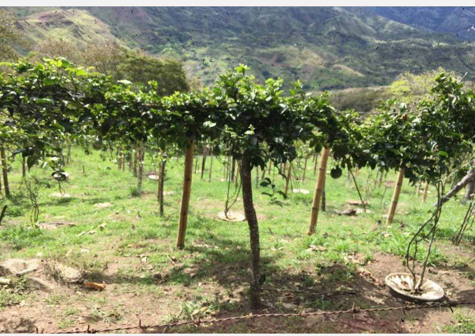
Panoramic view of Elvecia cultivation of passion fruit with Groasis Waterboxx®. Photo taken 20190619

Elvecia sold the passion fruit in the Almaguer market, which represented economic income of $ 100,000 COP pesos, values that have been destined for the benefit of all the members of the participating village.