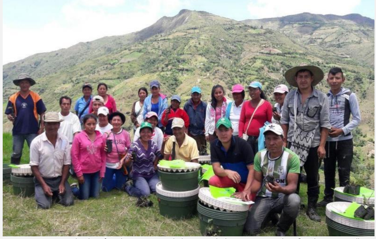
Hato Viejo Group on the day of implementation and planting with the Groasis Waterboxx® with Mora Castilla. Piloto Phase. Photo taken 20180227.

This situation especially affects the food security of caucanos and especially peasant communities both in their role as producers and that of consumers.