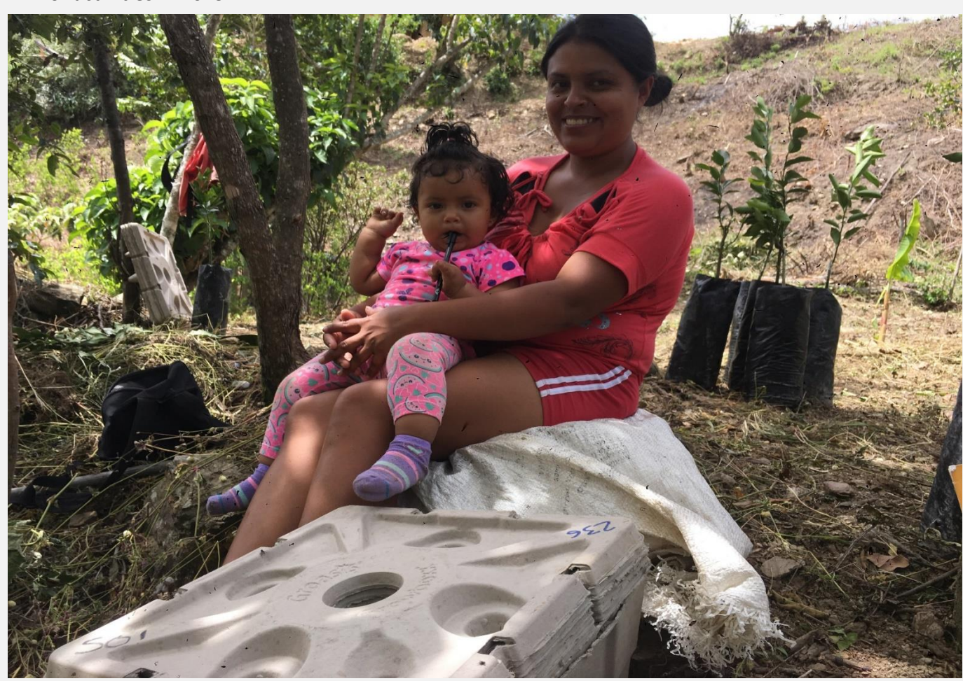
Woman with her daughter on planting day in Casablanca. Start Phase 2 with Groasis Growboxx®, in combination with fruits and vegetables. Photo taken 20190311.

The amazing results obtained until the end of 2018, with the passion fruit crops in Groasis Waterboxx®, inspired and motivated us to maintain the continuity of a new phase with our strategic partners, despite the tight and almost scarce budget we have for the development of activities in 2019.