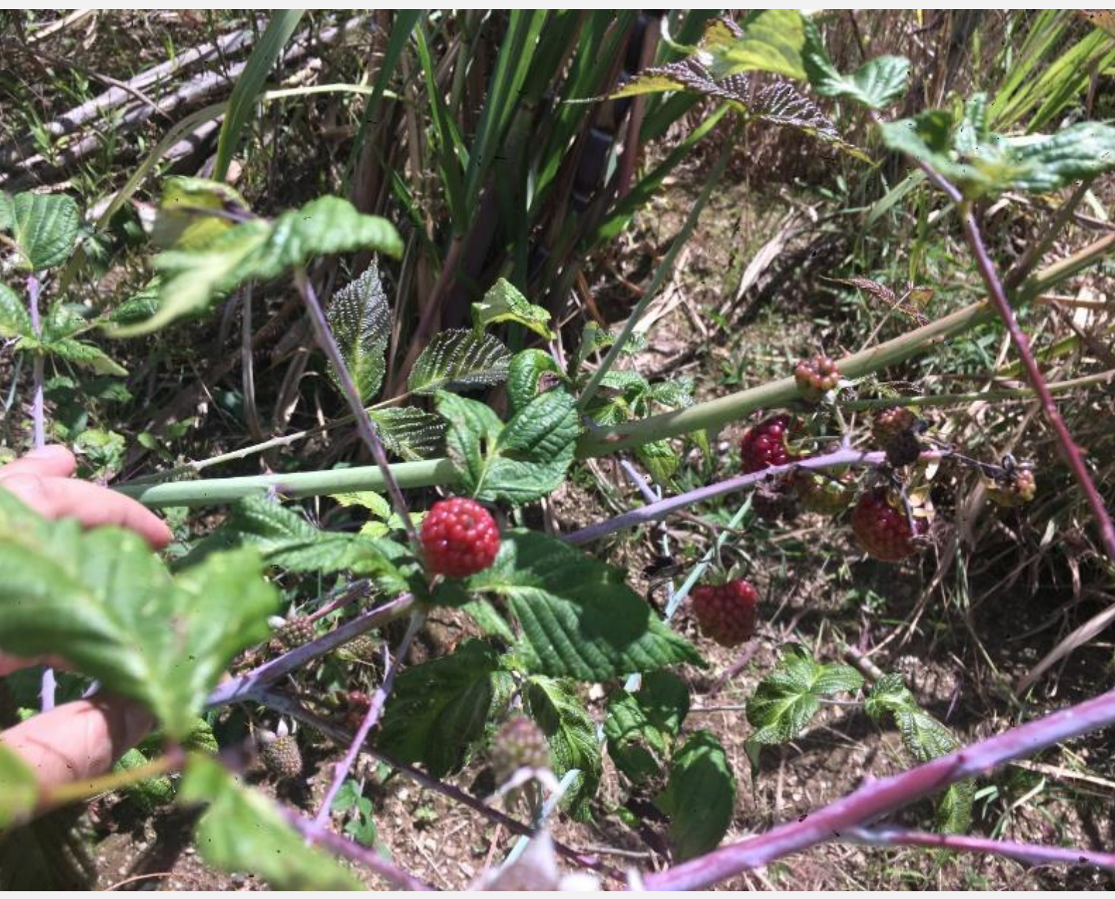
Blackberries Castilla in Gabrielas, without Groasis Waterboxx®. Photo taken 20190315.

The village Gabrielas, has obtained a first harvest of approximately 70 kilograms of Mora Castilla, whose commercialization in the peasant market was 6000 pesos COP.