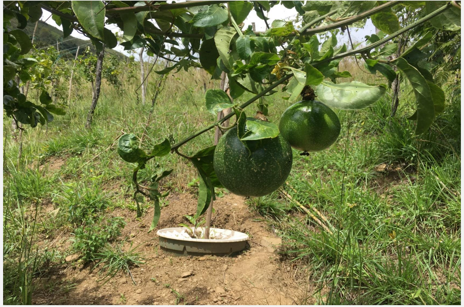
Passion fruit trees planted with Groasis Waterboxx® in Gonzalo. Photo taken: 20190619

Palizada has 90 Groasis Waterboxx® devices, they continue using the devices as sources / reservoirs of water for their trees.