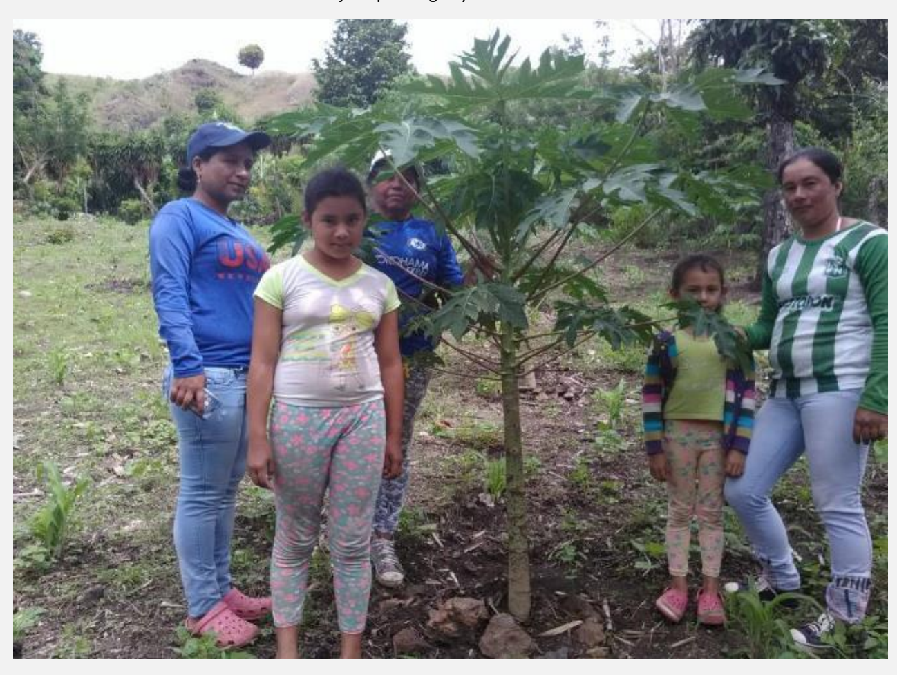
Group of women beneficiaries in Tarabita 1, with a papaya tree (7 months) with Groasis Growboxx. Photo taken 20190826