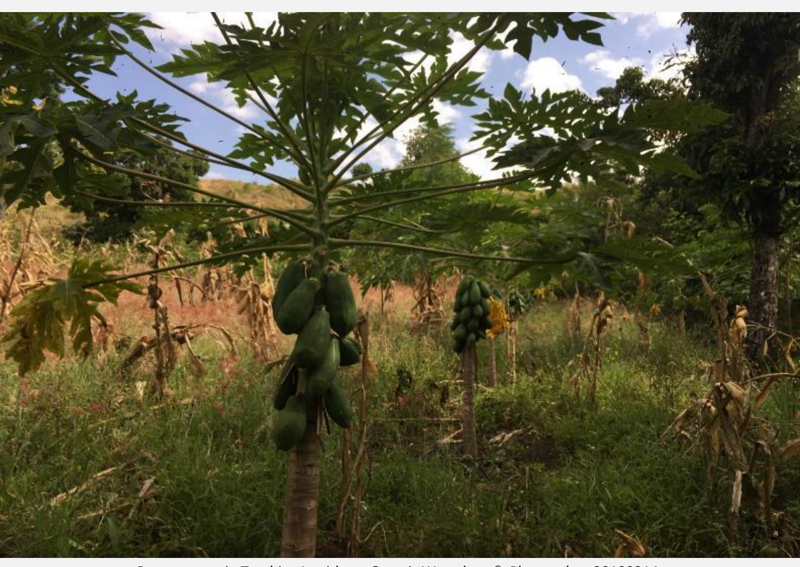
Papaya trees in Tarabita 1, without Groasis Waterboxx®. Photo taken 20190314.

The papaya crop was destined for family consumption (food security).