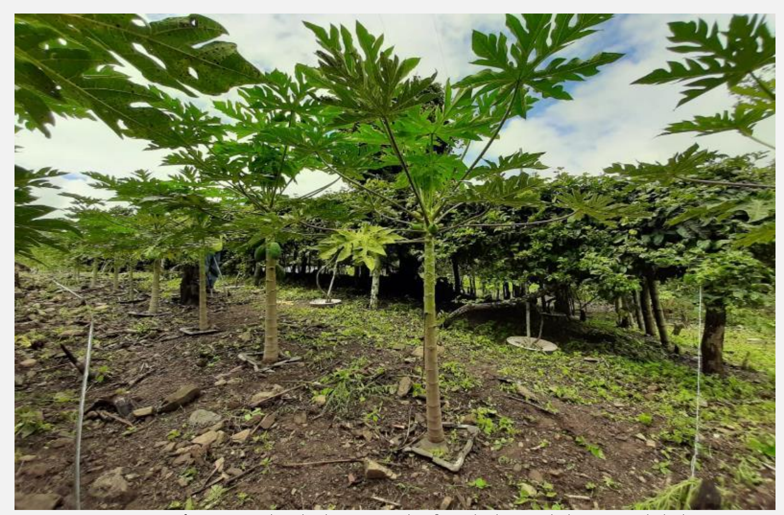
Panoramic view of papaya trees planted with Groasis Growboxx® on Palizada. 4 month plantation. On the back, the passion fruit cultivation with Groasis Waterboxx® is observed. Photo taken: 20191120

In Phase 2, the Groasis Waterboxx® continues to give excellent results.