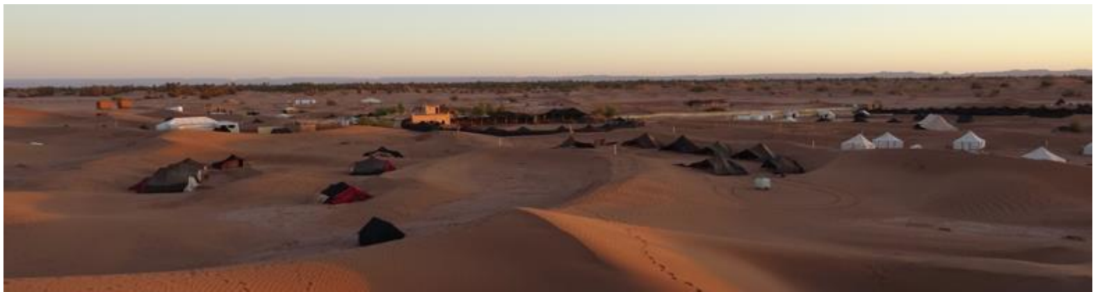
OCT 2017 Bivouac Le Petit Prince