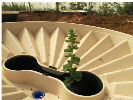
Thyme is one of the herbs planted and irrigated using the "Groasis Waterbox" technique.

https://sgp.undp.org/index.php?option=com_countrypages&view=testimonials&country=59&Itemid=271