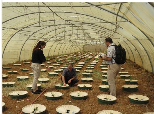
400 Waterboxes were installed to plant several species of medicinal herbs.