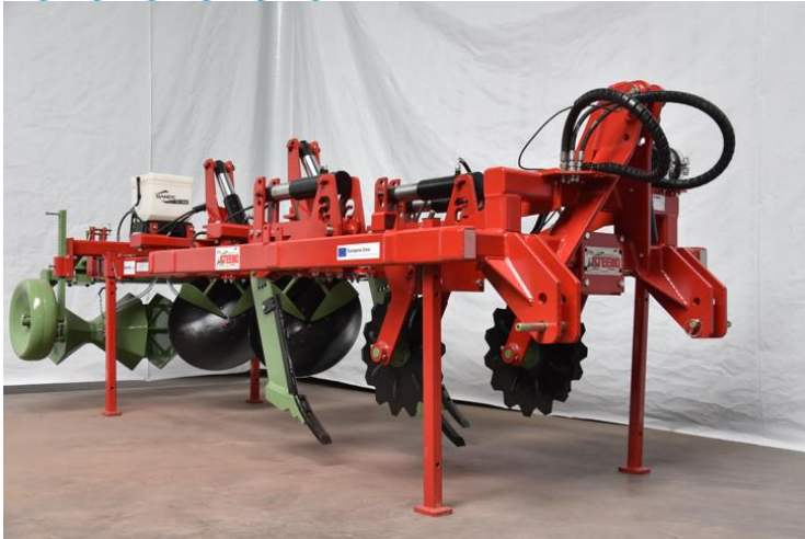
Groasis Terracedixx creates 1.500 to 15.000-meter terraces per hour.